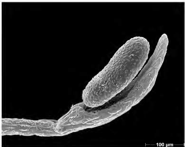
Figure 5: Drosera glanduligera tentacle with raised head (SEM).

To apply the minute pieces of fish food, adhering to a needle tip, onto the less than